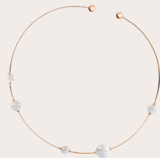
CHOCKER 750 rose gold MPJ20PCW16C42