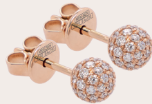
EAR STUDS 750 rose gold 6 mm MPJ50PCP17000