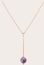
COLLIER 750 rose gold MPJ20PCL131C63