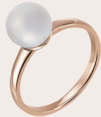
RING 750 rose gold MPJ10PCW1100