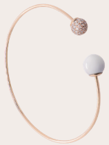
BANGLE 750 rose gold MPJ30PCP14C19