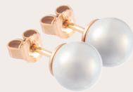
EAR STUDS 750 rose gold MPJ50PCW11000