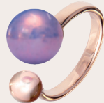
RING 750 rose gold MPJ10PCL1200