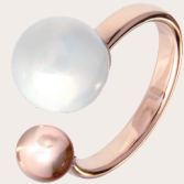
RING 750 rose gold MPJ10PCW1200