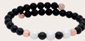
BANGLE 925 silver gold plated MPJ30PCO5111C