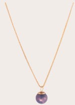
COLLIER 750 rose gold MPJ20PCL121C45