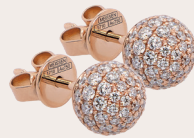
EAR STUDS 750 rose gold 8 mm MPJ50PCP11000