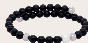
BANGLE 925 sterling silver MPJ30PCO4010C