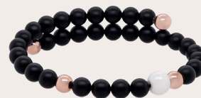
BANGLE 925 silver gold plated MPJ30PCO5010C