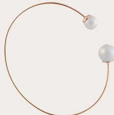
BANGLE 750 rose gold MPJ30PCW14C19