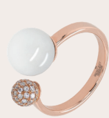
RING 750 rose gold MPJ10PCP1200